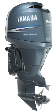
F150TXR / LF150TXR